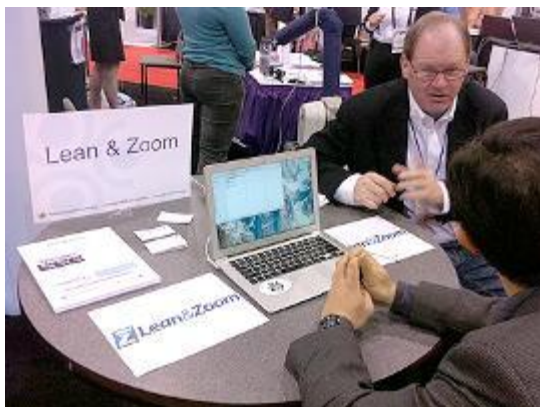
The Lean and Zoom table.