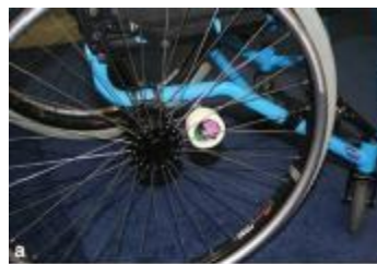
A. Custom data logger attached to manual wheelchair wheel.

The efficacy of using an objective assessment method for measuring use of wheelchairs was demonstrated by this study. This objective assessment method will help clinicians identify needs of older adults for prescribing individualized and customizable wheelchairs, rather than provision of standard wheelchairs.