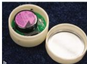
B. Data logger opened to view components.