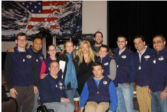
Celebrity winter sports clinic event supporters—actress Bo Derek and singer Taylor Dayne (center) with our researchers

144 athletes volunteered to participate in 4 research studies: