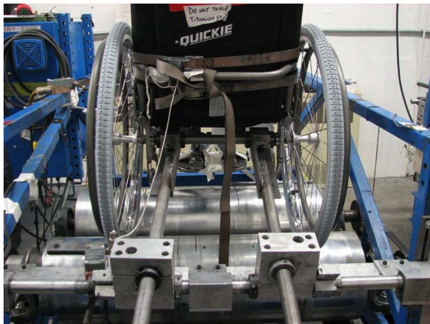
Quickie-Ti on HERL's double drum testing machine