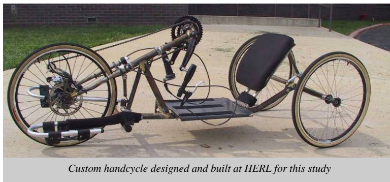
Custom handcycle designed and built at HERL for this study

Results: The result is a custom built touring style recumbent hand-cycle. During three years of evalua-