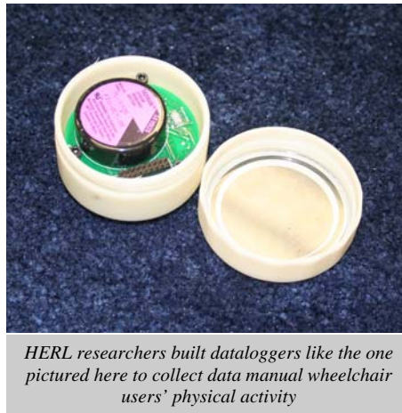
HERL researchers built dataloggers like the one pictured here to collect data manual wheelchair users' physical activity

Results: We found that the manual wheelchair users traveled an average of 2,457 meters per day at a speed of 0.79 meters per second for 8.3 hours per day