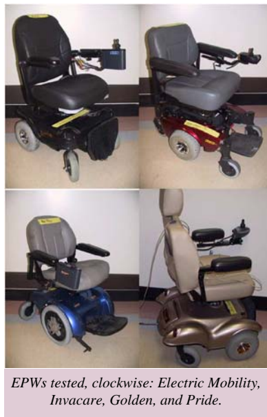
EPWs tested, clockwise: Electric Mobility, Invacare, Golden, and Pride.

Results: We found that 9 out of 12 of these devices did not fulfill the required durability standards. Additionally, other safety issues, such as motor overheating, could adversely affect the performance of