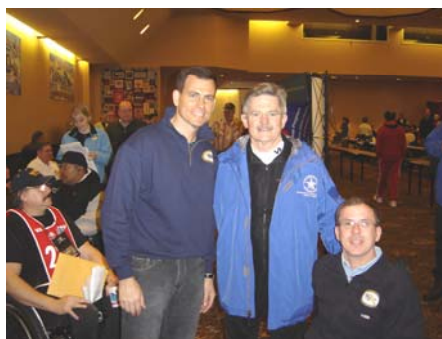
The Honorable R. James Nicholson, Secretary of Veterans Affairs (center), stopped by the HERL booth at the veterans' winter sports clinic

For the first time, HERL had the opportunity to attend and conduct research at the Disabled American Veterans (DAV)/VA Winter Sports Clinic from April 2-7 at Snowmass Village, CO (see "new grants," page 5). Also sponsored by the Department of Veterans Affairs, the DAV winter sports clinic promotes rehabilitation by instructing disabled veterans in adaptive skiing, and providing an introduction to other adaptive activities and sports. Researchers from WRAMC and Madigan Army Hospital