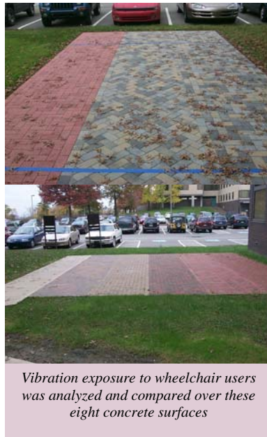
Vibration exposure to wheelchair users was analyzed and compared over these eight concrete surfaces

Results: For the manual wheelchair, three surfaces resulted in higher vibration exposure than the