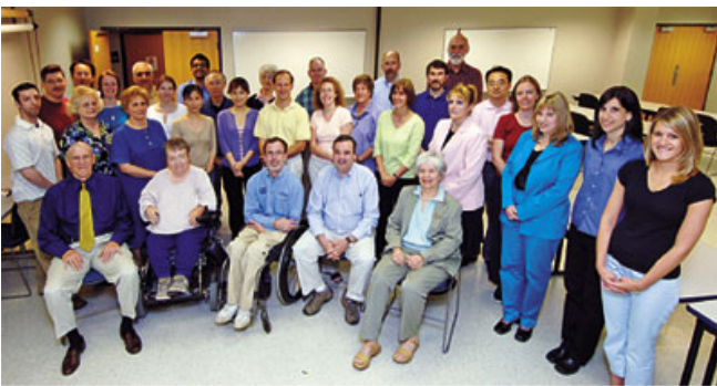
The Department of Rehabilitation Science and Technology received two prestigious awards this summer.

The University of Pittsburgh's Department of Rehabilitation Science and Technology (RST) received two prestigious awards this summer. RST received the 2005 "Leadership Award" from the Rehabilitation Engineering and Assistive Technology Society of North America (RESNA). The award was given "For exemplary leadership in the development and conduct of an academic program in assistive technology."