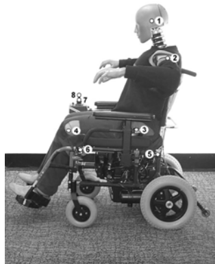
Hybrid II Test Dummy

Results: The results are mixed based on the bioequivalence criterion selected. Average bioequivalence methods would tend to indicate that further