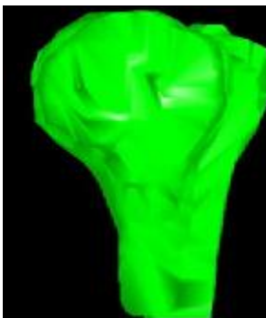
3D computer generated shoulder model