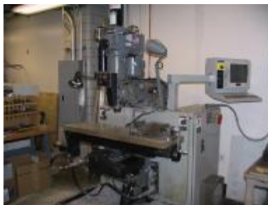
The CNC Mill

It will cut any type of metal. The Laser Lithography machine allows the shop to produce prototypes of parts and assemblies made from a photopolymer resin. In this machine, a laser is played across the surface of a liquid resin. The resin is cured and hardened by the laser to form layers of the part being produced. After each layer is scanned, the machine covers the part with another layer of liquid resin and the laser is played over the new liquid layer.