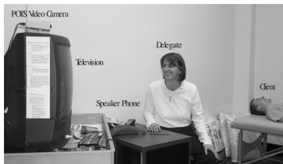
Setup of Telerehabilitation equipment at HERL

Subjects/ Procedures. Four licensed therapists with experience in seating and mobility evaluations conducted assessments, on 20 model patients. The model patients used a standard wheelchair during the assessment in order to avoid biasing the evaluators towards a prescription. The group of model patients consisted of ten females and ten males with the mean age of 42.4 years ( \pm 13.1 years). The primary diagnoses included Rheumatoid Arthritis, Engel-