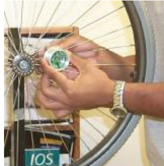
"Dataloggers" built at the Human Engineering Research Labs, record speed and distance during wheelchair use

Results. The average power wheelchair user traveled 203.34 meters an hour (0.13 miles) at an average speed of 0.3992 meters/second (0.893 miles per hour) and an average of 3792.22 meters (2.36 miles) at a speed of