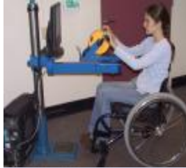
Left: The GAME Cycle Exercise System. Right: Diagram of handgrip with fire-button

Objectives: The Game Cycle exercise system is an interface between an arm ergometer and a computer game and was designed to provide motivation to individuals who use wheelchairs to exercise on a regular basis. Some users showed an interest in having "fire-control" buttons in order to