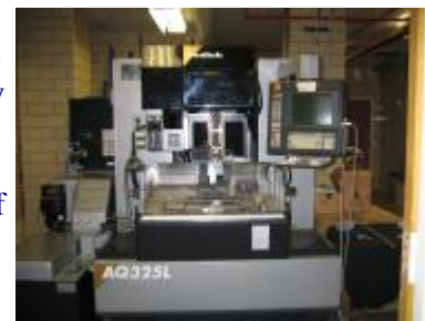
The new Wire EDM machine