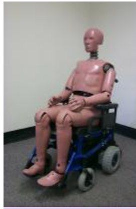
The Hybrid III Test Dummy

Subjects/Procedures. A HTD was modified to emulate a person with a spinal cord injury. A wheelchair user with T8 paraplegia was the basis of comparison. Subjects were seated in a power wheelchair. A test operator drove the power wheelchair at three different speeds and used three braking methods to rapidly decelerate the wheelchair to a stop. Motion of the human test pilot and HTD were recorded and described in mathematical