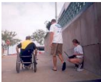
In this study, we measured the force needed to propel one's wheelchair across various surfaces, ramps, and to 'wheelie' for 10 feet