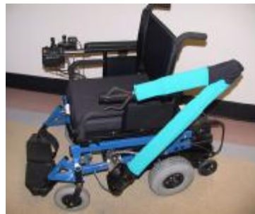
The Wheelchair Mounted Robotic Arm

devices can lead to improved independence (reduced need of attendant care), enhanced self-esteem, increased mental stimulation, and improved interaction and control over the living environment.