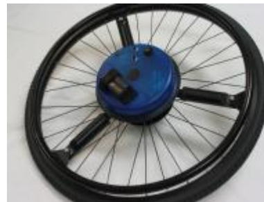
The Smart wheel provided forces and moments in three global reference planes.

Subjects/Procedures. Twenty-eight manual wheelchair users (MWUs) with paraplegia enrolled in this study. Velocity of the hand and the wheel were calculated us-