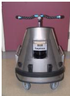
The VA-PAMAID Robotic Walker

Relevance to People with Disabilities. The U.S. Census Bureau study on Americans with disabilities found that there were 7.6 million people with a visual impairment. By the year 2030, there will be 65 million people over the age of 65. Falls in nursing homes led to an annual cost of $20.2 billion in 1994 and are predicted to cost close to $32.4 billion by the year 2020. A walker that could provide navigational assistance in addition to support could help reduce the cost of care and increase the independence of thousands of individuals.