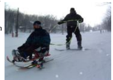
Skiers using adaptive equipment at the HOPE Network Ski Classic