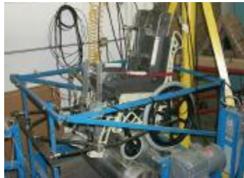
A manual wheelchair on the double drum test machine

Procedures: Fatigue life is the time between when the wheelchair is first used to the point at which the wheelchair no longer serves its purpose. Essentially, fatigue life can be understood as the length of time it takes for the wheelchair to fall apart. This quality was tested in a laboratory by means of double-drum tests and curb-drop tests, during which each wheelchair was equipped with a weighted dummy to simulate actual use. The double-drum test is made up of two rollers, each of which have 1-cm high slats attached to them. The wheelchair is secured on top of these rollers so the wheels go over the slats, which simulate sidewalk cracks, door thresholds, and other various obstacles. The wheelchair passes the test when it successfully undergoes 200,000 cycles on this machine. When a wheelchair is tested on the curb-