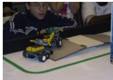
A robot attempts to push the competition off the playing table