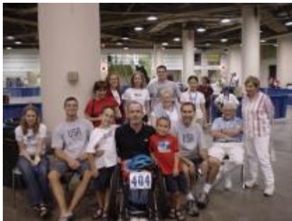
The HERL Research Team at the National Veterans Wheelchair Games in Cleveland in July.

This summer has been a busy and productive time at the Human Engineering Research Laboratories. HERL faculty and students attended the annual Rehabilitation Engineering Society of North America (RESNA) conference in Minneapolis, MN from June 27-July 1st, 2002. The last edition of the newsletter featured abstracts from HERL's five RESNA student award winning papers. There are additional articles on HERL research presented at RESNA featured inside this edition of the newsletter. In other RESNA conference news, the society honored HERL