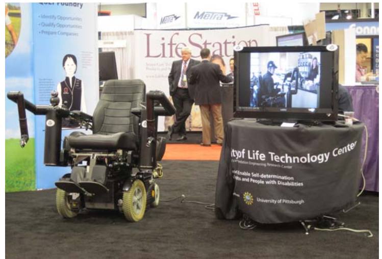
PerMMA on display at the Quality of Life Technology (QoLT) booth at the Consumer Electronics Show in Las Vegas on January 12, 2012.

Finally, one of the great things about PerMMA is how it's led to collaboration with all kinds of different groups. We have been using PerMMA to introduce students to commercialization and entrepreneurship through evaluation of PerMMA's commercial potential - and several companies have approached us about bringing PerMMA to market.