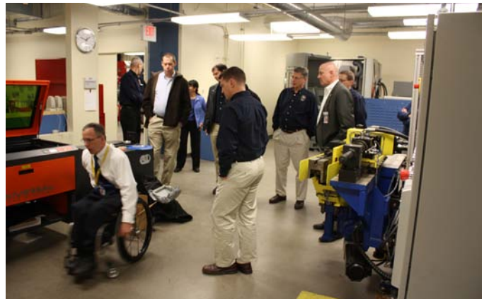
Dr. Cooper shows ICAF students around the machine shop