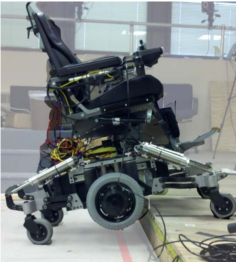
PerMMA Gen II makes its way up a step.

onto the curb, and then the driving wheels lift themselves up and forward onto the curb, lifting the chair. This is done automatically, whenever PerMMA Gen II senses a curb or step. The ultimate goal is for PerMMA Gen II to climb a set of stairs.